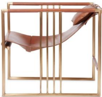
McGUIRE "HAYBINE" SLING LOUNGE (PRICE UPON REQUEST/ BAKER)

Let Marfa's West Texas landscape and MODERN DESIGN be your muse.