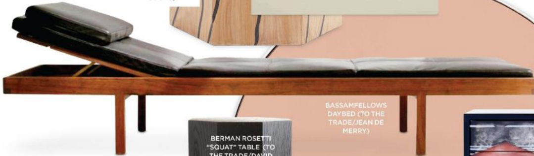
BASSAMFELLOWS DAYBED (TO THE TRADE/JEAN DE MERRY)