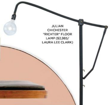
JULIAN CHICHESTER "RICHTER" FLOOR LAMP ($2,985/ LAURA LEE CLARK)