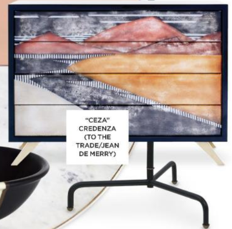
"CEZA" CREDENZA (TO THE TRADE/JEAN DE MERRY)