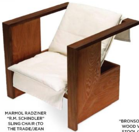
MARMOL RADZINER "R.M. SCHINDLER" SLING CHAIR (TO THE TRADE/JEAN DE MERRY)