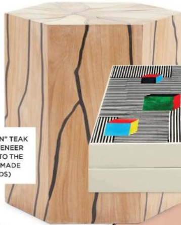
"BRONSON" TEAK WOOD VENEER STOOL (TO THE TRADE/MADE GOODS)