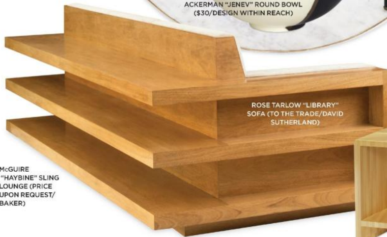
ROSE TARLOW "LIBRARY" SOFA