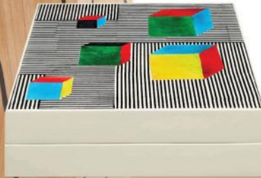
"MILLE JEUX" LARGE BOX ($1,425/HERMÉS)